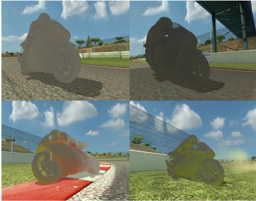
These images show the hemisphere lighting on its own, using a single DXT1 format radiosity map that encodes both shadow and ground color information