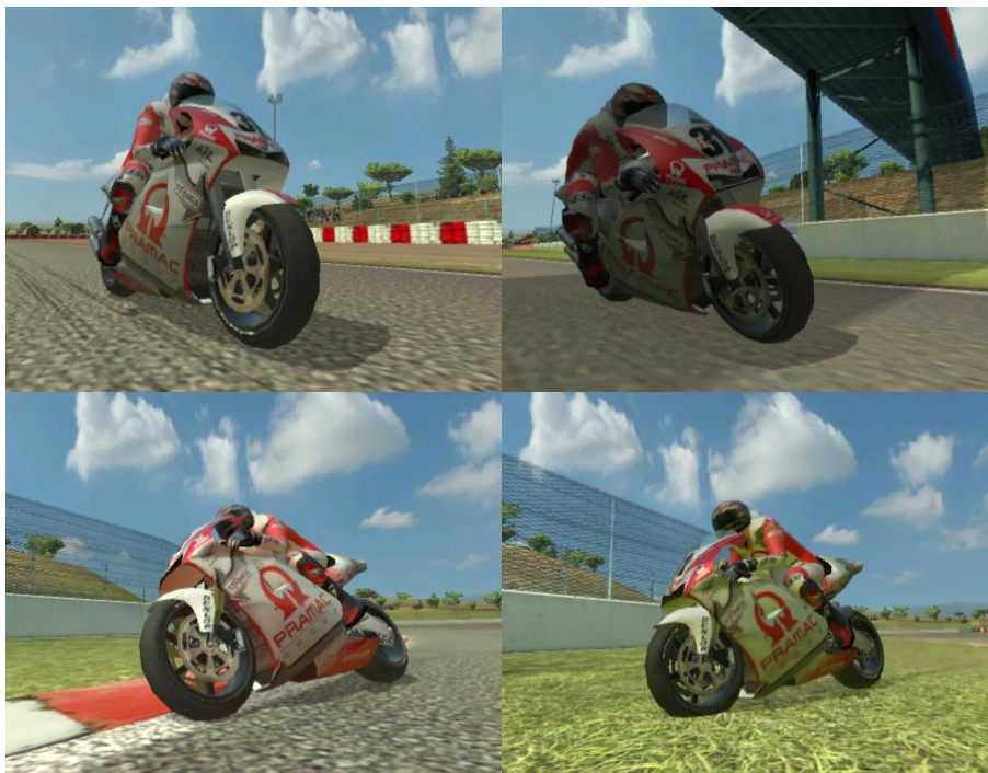
The complete lighting model, combining a base texture, radiosity hemisphere, Fresnel cubemap, and dot3 sunlight